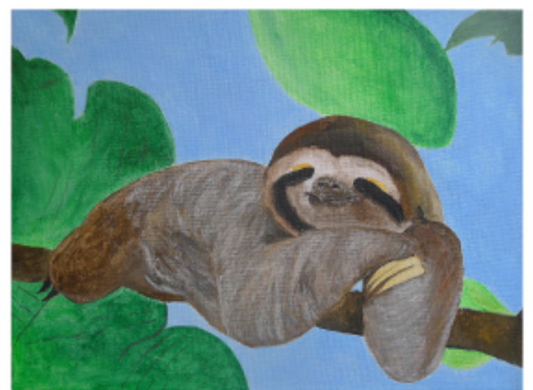
Acrylic painting by Joy W., Prince of Wales Secondary, Grade 12