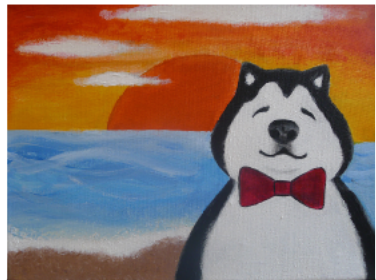
Acrylic painting by Ellie X. Prince of Wales Secondary, Grade 12

The aboriginal peoples of this land have a reverent attitude to and connection with all other lifeforms especially animals. In fact, animals are often considered to be a people too, and are called names such as The Bear People, The Deer People, The Salmon People.