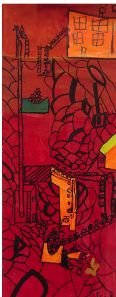
By Isaak N., Cleveland Elementary, SD#44

6. Children can go “shape shopping”, and pick 10 shapes.